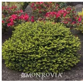
Dwarf Norway Spruce