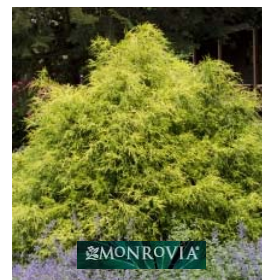
Gold Mop False Cypress