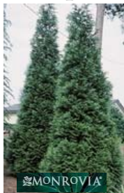
Green Giant Arborvitae