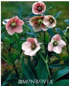
Lenten Rose Varieties