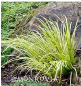
Sweet Flag Grass